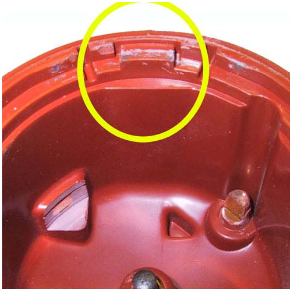
Bosch right angle cap